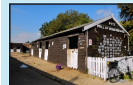
■ This wooden 8ft x 50ft x 14ft building will cost around £15,000 to replace. It was built before 1983, when Ernie and Paula Clark took over the site