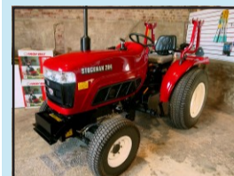
■ For years Hopefield has needed a tractor. The vehicle, costing in the region of £8,000, will help with maintenance like fixing fences and clearing the muck heap