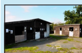
■ A replacement stable block - 8ft x 30ft x 20ft - wooden - £15,000. This accommodation is more than 30 years old. The roof has become a danger to the animals